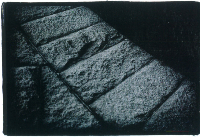
● From the exhibition Urban landscapes, 2001 ● From the exhibition Urban landscapes, 2001