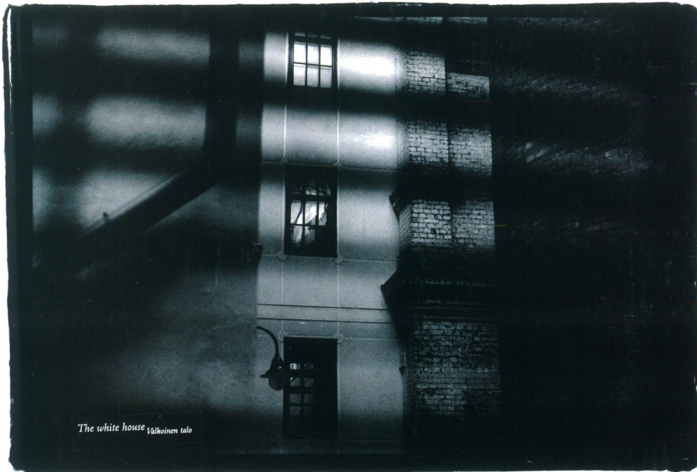
● From the exhibition Moods, 2004