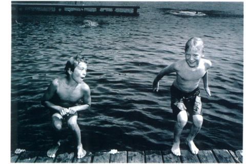
● Documentary project Tampere, Kaukajärvi, 16 July 2003

Photos from Arffman's exhibitions and Documentary project Tampere.