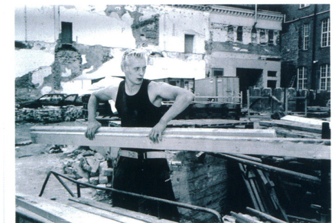
● Documentary project Tampere, Finlayson, 28 August 2003