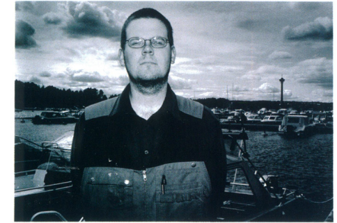
● Documentary project Tampere, Lappi, 28 May 2004